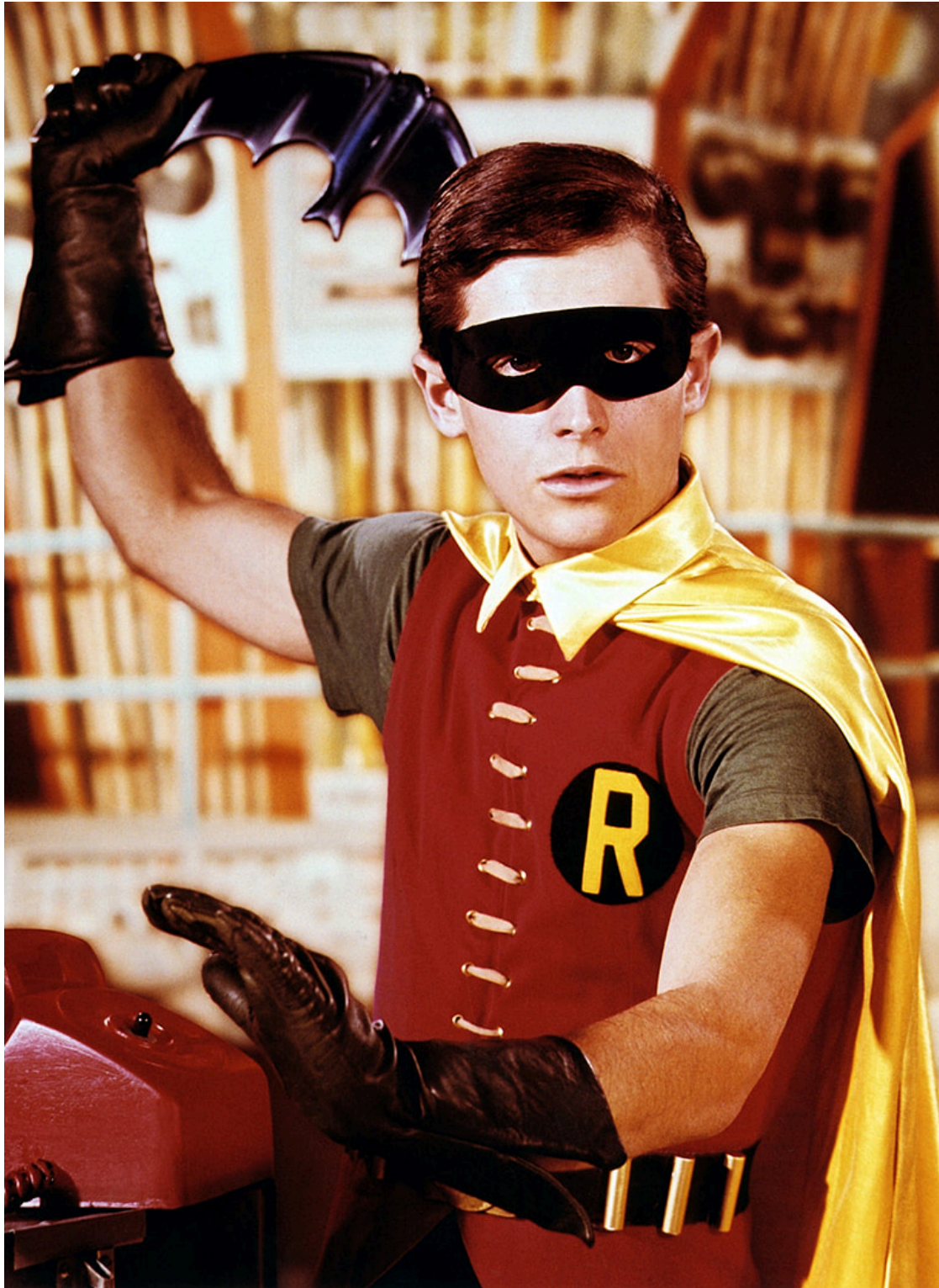
Burt Ward as "Robin" President